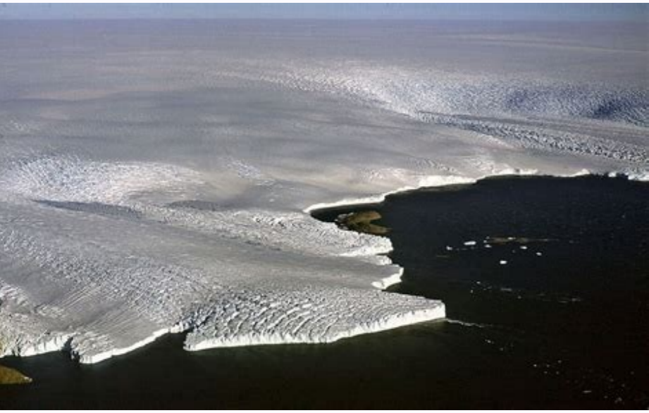
Is the antarctic ice sheet growing or shrinking. How big is the antarctic ice sheet. What is the antarctic ice sheet.